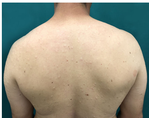
Figure 2 Multiple hypopigmented papules with central atrophy in the dorsum and upper limbs.