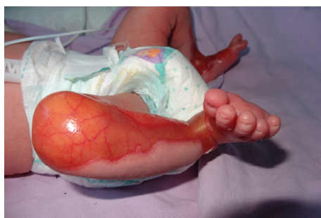
FIGURE 1: Sharply demarcated lesion margin.