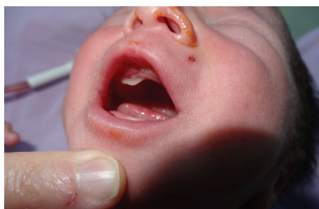
FIGURE 2: Blisters on the upper lip mucous membranes.

Patient was referred to dermatology. Physician recommended to allow the area to heal spontaneously by using conservative wound care such as topical antibacterial ointment and wet gauze dressing two to three times a day. The patient was treated by applying topical mupirocin (Bactroban) and wet gauze dressing (Bactigras) for 4 weeks and skin lesions had recovered substantially with appropriate therapy. The infant was discharged on the tenth day of hospital stay to continue local wound care by his mother.