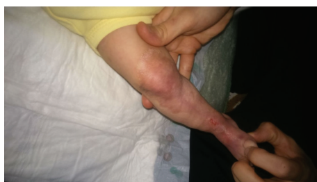
FIGURE 4: Healing of the lesions with conservative treatment.

Epithelialization process on the lesions was noted on the tenth day of hospital stay and the infant was discharged. As shown in Figure 4, the wound healing in this patient is rapid, efficient, and perfect.