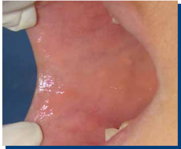
Figure 3. Clinical control observing full resolution of the lesions and all the features of a healthy mucosa.