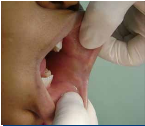
Figure 6. Resolution of lesions after the application with trichloroacetic acid.

The FEH is a benign proliferative disease of chronic course, affecting the oral mucosa. Ledesma et al, described that focal epithelial hyperplasia is characterized by multiple papules with a color similar to adjacent mucosa, the most frequent site of involvement are the buccal mucosa, lower and upper lip mucosa, lip commissure and tongue. The lesions appear as circumscribed, soft, non-tender, flattened or rounded papules, the surface of the lesions is smooth and it varies from 0.1 to 0.5 cm in diameter (19) , agreeing with the present series of cases where the clinical manifestations were similar.