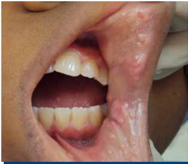
Figure 5. Multiple papules on lip, buccal and tongue mucosa.

Trichloroacetic acid was applied to 80% without referred any pain, after 15 days first control was made, observing multiple lesions but with a decrease in diameter and height, then, two applications were made every fifteen days observing absence of the lesions and a healthy mucosa (Figure 6), after 6 month there is no sign of recurrence.