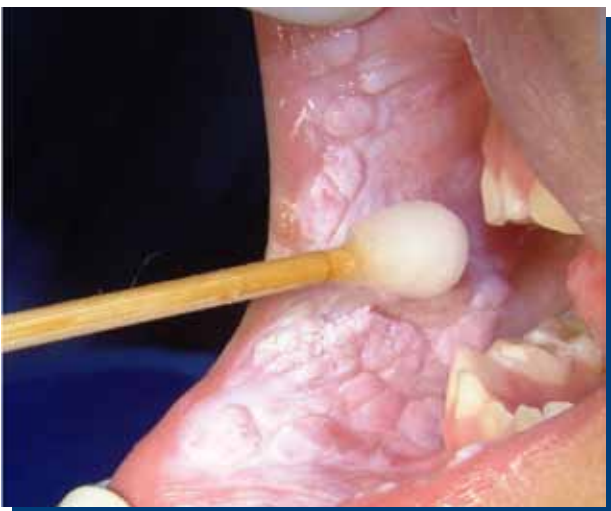
Figure 2. Trichloroacetic acid application over the lesions at 80%.