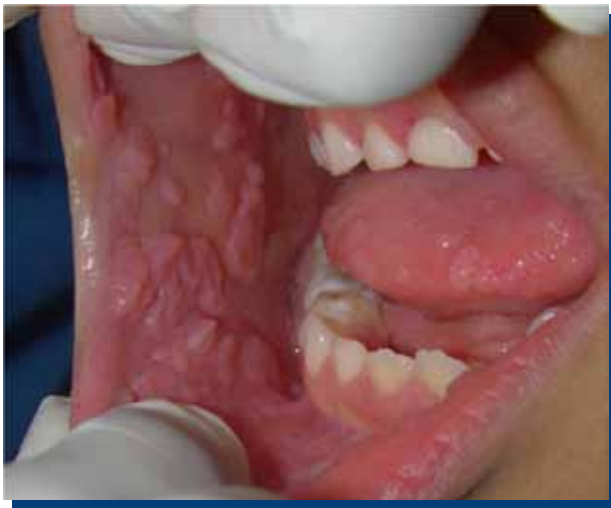
Figure 1. Multiple papules, located in the buccal mucosa, labial and the anterior third of the tongue.

Trichloroacetic acid was applied to 80% following the above application mode (Figure 2) describing the absence of symptoms. First control was performed fifteen days after the application observing multiple lesions in lower labial mucosa, buccal mucosa and tongue, but with a decrease in diameter and height, then five applications were performed every fortnight noticing in control number 6 a completed resolution of lesions and all the characteristics of a healthy mucosa, such as good elasticity, pale pink mucosa, vascularized, moist and shiny (Figure 3). It's no sign of recurrence after one year follow up.