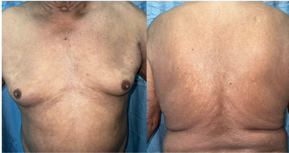
Fig 3. Improvement of the skin lesions, with persistence of postinflammatory hyperpigmentation.

the messenger RNA-1273 SARS-CoV-2 vaccine (Moderna); recurring after booster administration. 9 Tan et al 10 reported a case of erythema nodosum and IGD accompanied by fever and nocturnal diaphoresis, 3 days after receiving the second dose of the Pfizer-BioNTech COVID-19 messenger RNA vaccine. 10