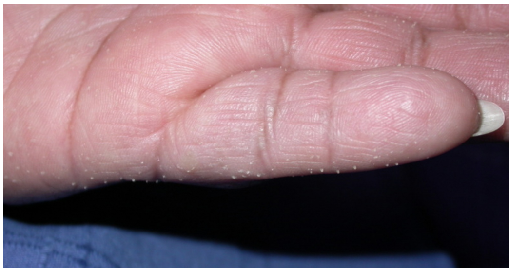
FIGURE 1: Palmar spines on the left hand.

Multiple, firm one mm spicules on the volar surface of hand and digits.